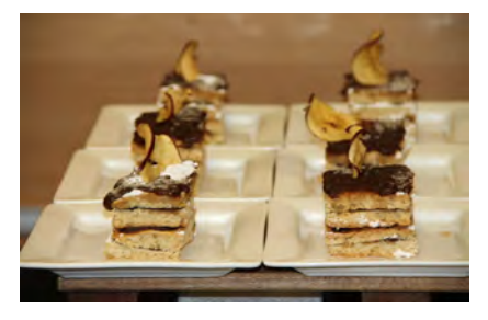
Appalachian apple stack cake for dessert