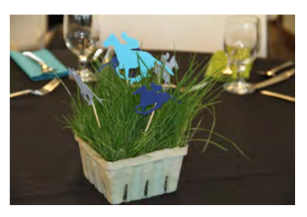
Horses and jockeys, made by Danya Costello, ride amidst blue grass