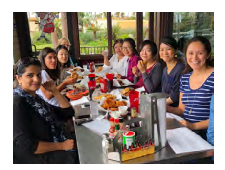
Lunch at Phil's BBQ