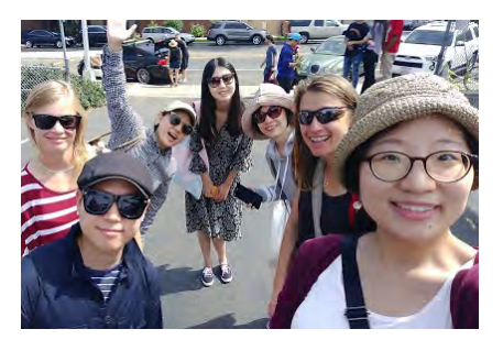
La Jolla Farmers Market

Periodically program leaders, or the participants themselves,